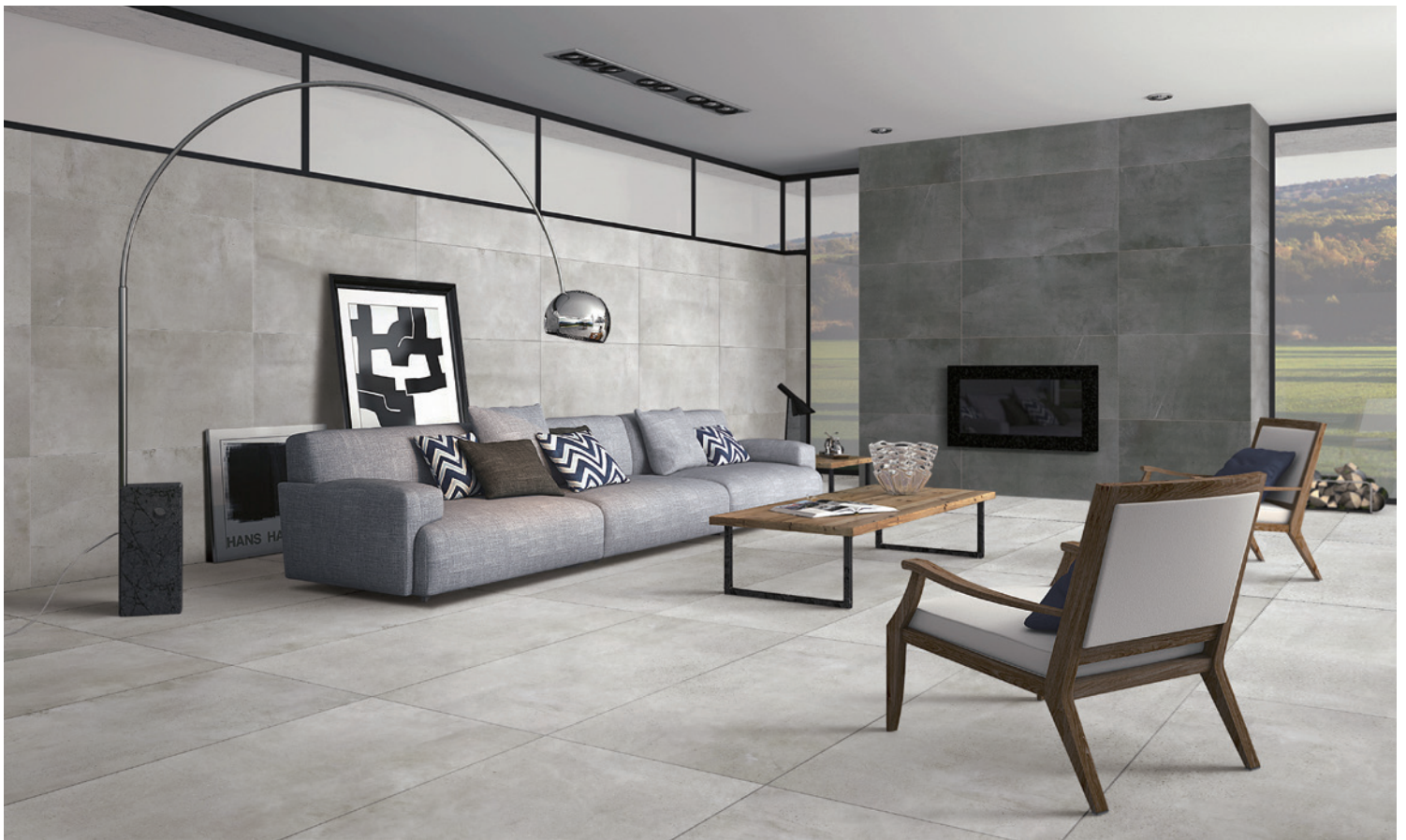
MEDIUM GREY Matte