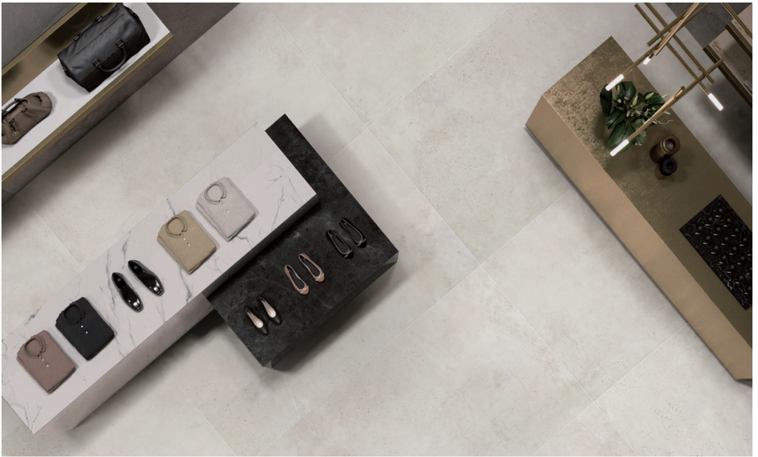
LIGHT GREY Matte